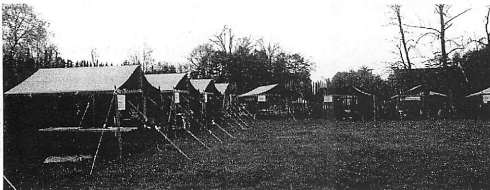
Left: "Tent Village" at Celebration. These tents housed descendants of families that settled Bethabara 250 years ago.